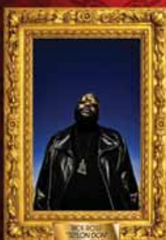
WILL.I.AM THE UNDISCIPLED MAY 6, 2010