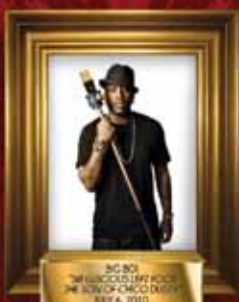
BIG BOY THE UNDISCIPLED LIFE FORCE THE SON OF CHICO DUSTY MAY 6, 2010