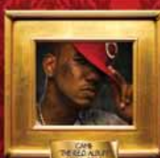
CHRIS BROWN THE UNDISCIPLED MAY 6, 2010