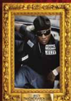
YOUNG JEEZY THE UNDISCIPLED COMING SOON