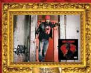
THE ROOTS THE UNDISCIPLED MAY 29, 2010