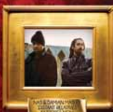
JAY-Z & EMINEM THE UNDISCIPLED MAY 29, 2010