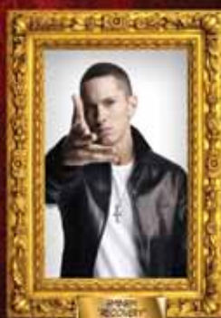
DRAKE THE UNDISCIPLED MAY 6, 2010