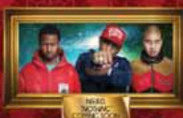
THE ROOTS THE UNDISCIPLED COMING SOON