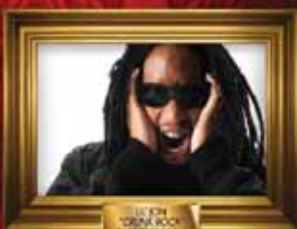
DRAKE THE UNDISCIPLED MAY 6, 2010