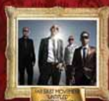
THE ROOTS THE UNDISCIPLED COMING SOON