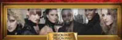
THE ROOTS THE UNDISCIPLED COMING SOON