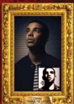
DRAKE THANK ME LATER MAY 15, 2010