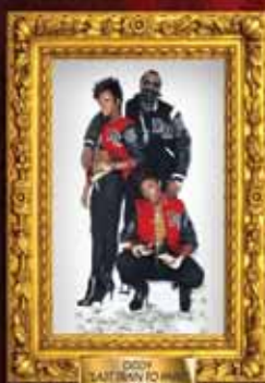
THE ROOTS THE UNDISCIPLED COMING SOON